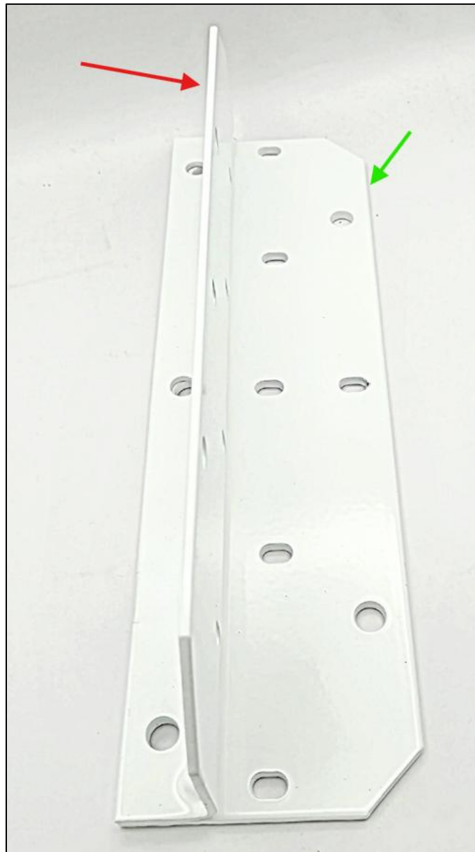
Wide, angle (red arrow) atop Wide, flat (green arrow)