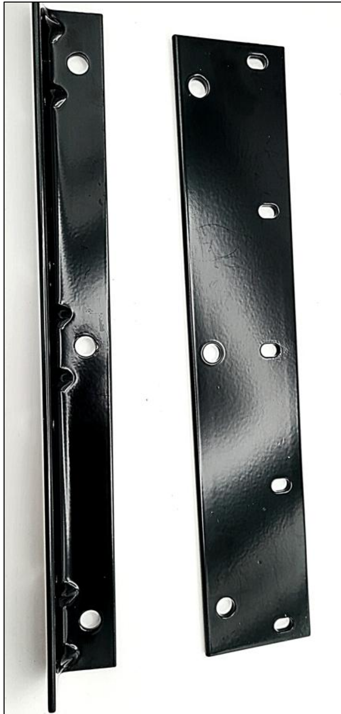
Narrow, angle left; Narrow, flat right