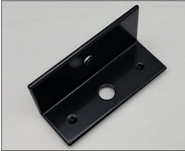
3" Bracket - Angle